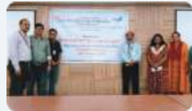
SWAYAM NPTEL Local Chapter