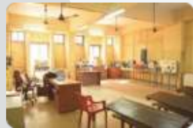
Heat Transfer Lab