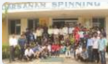
Darsanam Spinning Cotton Mill